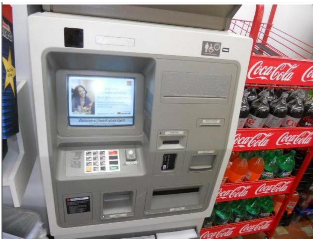
5838V - 07/28/2011 - CLOSE UP GAS STATION 296 E 7TH ST,ST PAUL,MN 55101